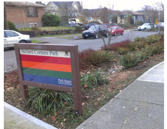
A curb-cut roadside rain garden at Ballard Corners Park .