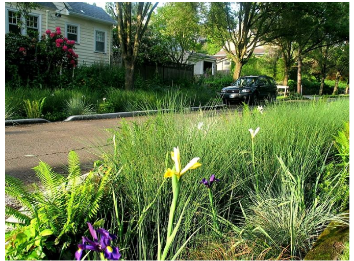
Photo shows a typical rain garden. The curb is cut so that water can flow out of the street and into the garden! We work with engineers and landscape architects to ensure a sound process.

The East Ballard GreenStreet project team will select a cluster of properties along one block and work with the residents and other volunteers to construct a small natural drainage rain garden in the planting/parking strip at no cost to the homeowners .